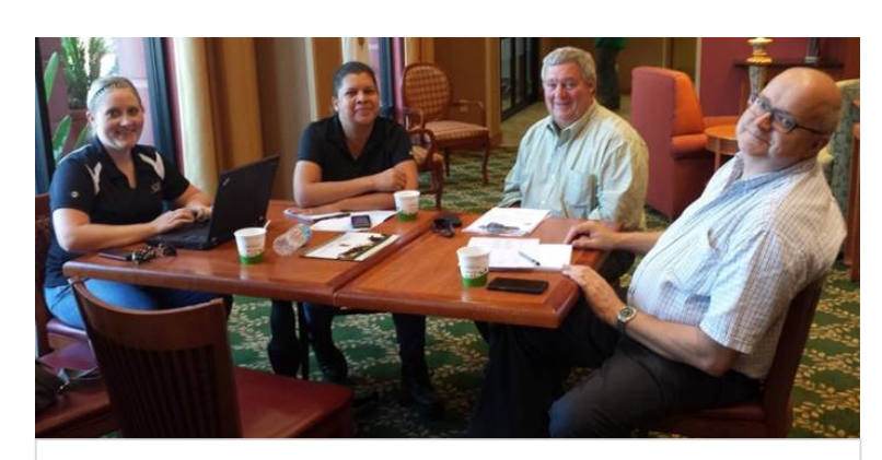
Assessment preparation: SGS and World Animal Protection